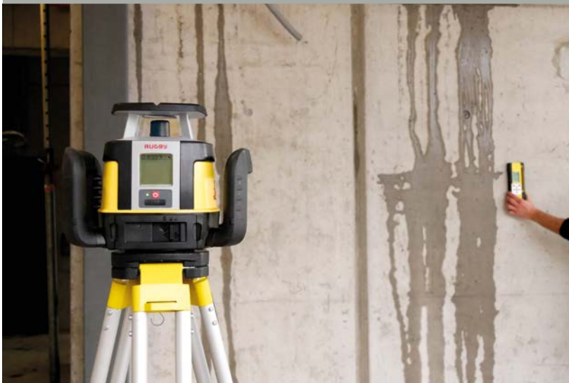
HORIZONTAL ONE-BUTTON LASER