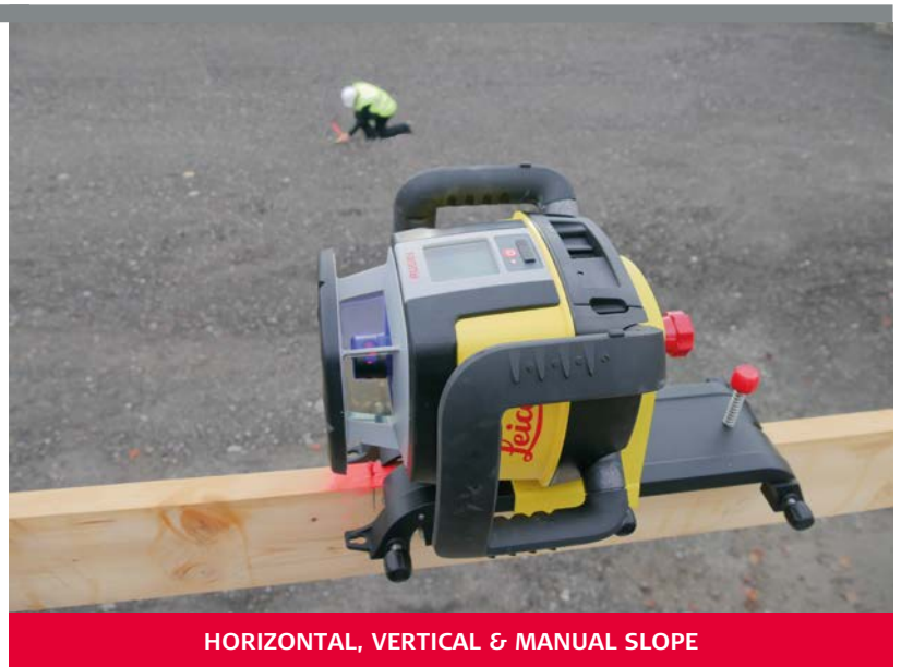
HORIZONTAL, VERTICAL & MANUAL SLOPE