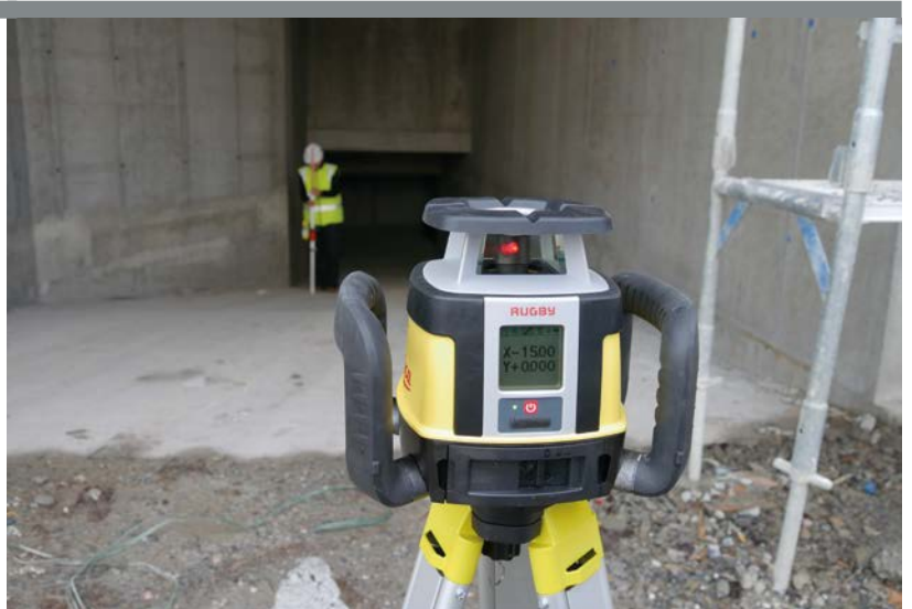
HORIZONTAL, VERTICAL & FULLY-AUTOMATIC DUAL GRADE WITH DIAL-IN