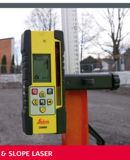
& SLOPE LASER