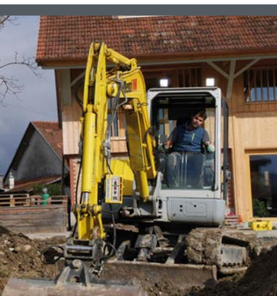
FULLY-AUTOMATIC DUAL GRADE WITH GPS COMPATIBILITY